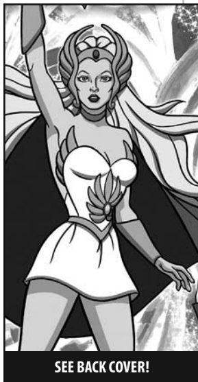
SEE BACK COVER!